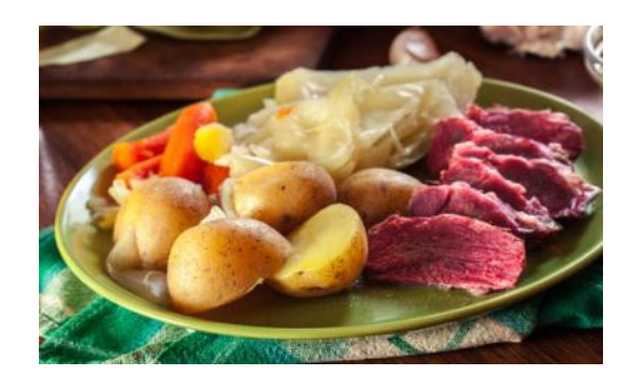
ST. PATRICK'S DAY DINNER ~ Saturday, March 15th Dinner served at 5:30pm Come join us for some great food & Irish music!