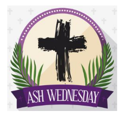
ASH WEDNESDAY SERVICES March 5th ~ 7:00am & Noon