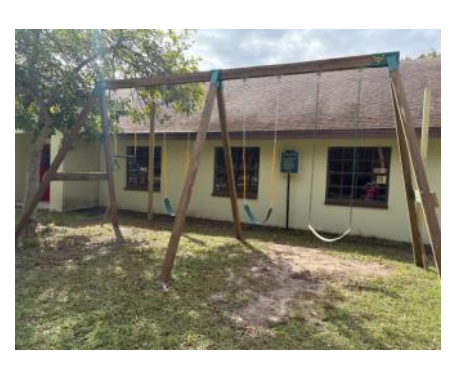
A note from our Jr. Warden...